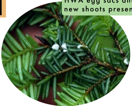
HWA egg sacs and new shoots present